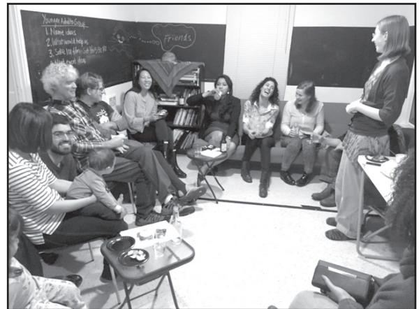
Revelers at the Kansha Happy Hour