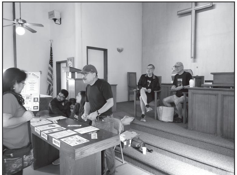
Volunteers in action at the 2017 Parkview Breakfast

May God bless our ministry. See you in church. Aart