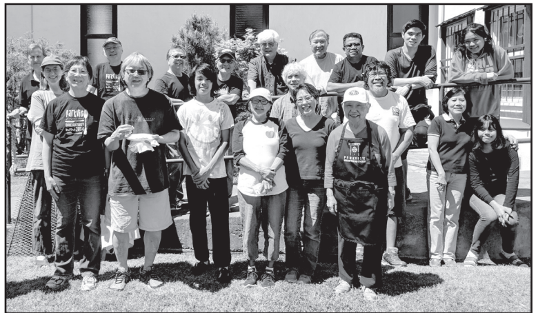
Some of the many volunteers at the church clean-up day

Not everyone agreed with what we let go of in our Spring cleaning last month, but it served the purpose of holding on to the potential of a functioning and versatile campus. May we have the courage to let go of the comfortable so we can hold on to the promise of a bright future.