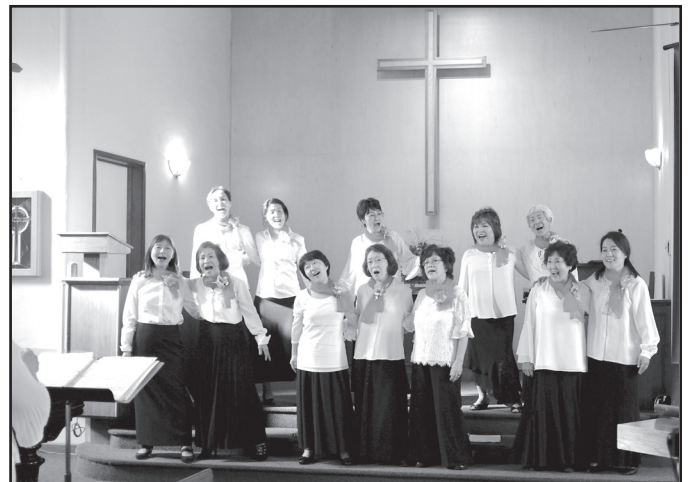
The Sakura Chorus singing a lively tune.