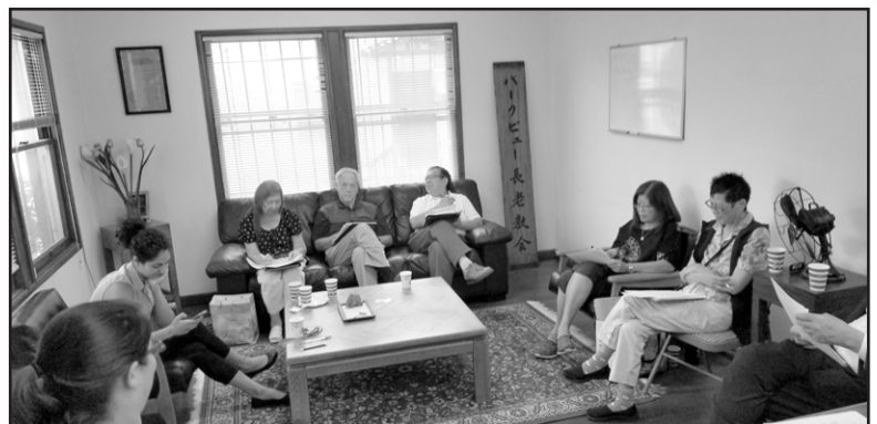
Session Meeting - June 9, 2019