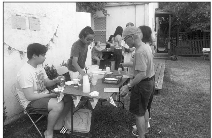
At the 4th of July celebration