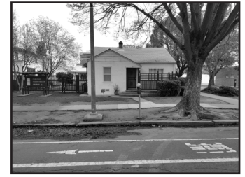
View of the Kansha

The Congregational Support Ministry Team of the Sacramento Presbytery has recently approved a $10,000 grant to Parkview. The grant will be used for much needed repairs to improve the safety, security, and health of our Parkview community. The repairs include fixing all doors and upgrading locks, replacing broken windows, adding lighting to the interior courtyard and exterior areas of the property, bringing the Kansha residence up to code, and repairing and reconfiguring the wooden fence surrounding the property. Parkview is grateful to the Presbytery for this grant, and many thanks go to Pastor Pamela, Maurine Huang, and the Buildings & Grounds Committee (Phillip Chew, Steve Hill, and Gary Younglove) for their work on the grant.