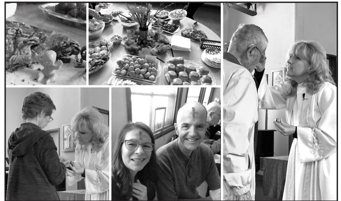
Mar 1 Worship to Celebrate Ash Wednesday

We are also leading a Lenten series for small group conversations that will coincide with the theme of that week's sermon. These Lenten conversations are a way for us to strengthen our Adult Spiritual Formation program and to get into deeper conversations around our faith. The gatherings will take place in the pastor's office on Tuesday evenings from 6:30-7:30 pm and Friday mornings from 10:00-11:00 am. Please enter through the front door of the church, and knock loudly, if the door is locked.