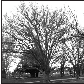
View from the Kansha

"We order our worship first and foremost by the authority of the Word of God, and acknowledge that there is always room to reshape its order as needed as we seek to be ordered by that authority." (W-2.0102)