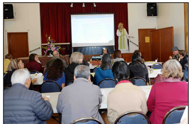
January 2020 Congregational Meeting