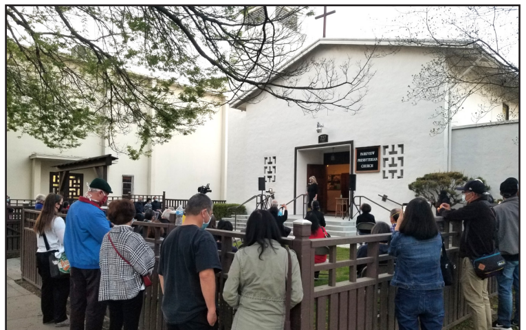
At the Interfaith Prayer Vigil, March 26, 2021

"I thank my God every time I think of you." (Philippians 1:3)