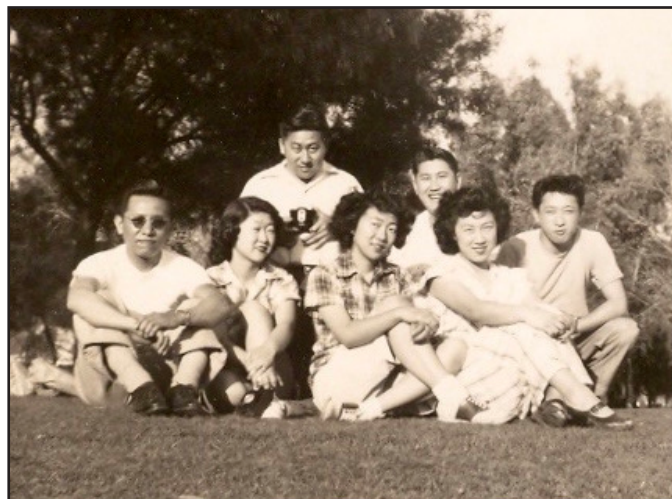
1945: young adult group meeting at Parkview