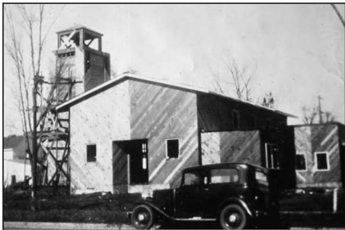
1940-41: Parkview under construction.