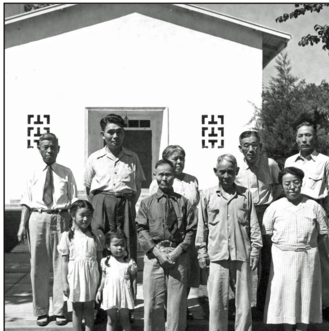
June 1945: Parkview opens a hostel to assist families returning from incarceration camps.

What items (photos, documents etc.) can you share?