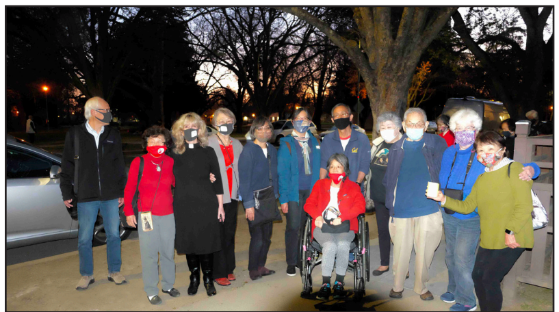
At the prayer vigil, Mar 26, 2021

“I thank my God every time I think of you.” Philippians 1:3