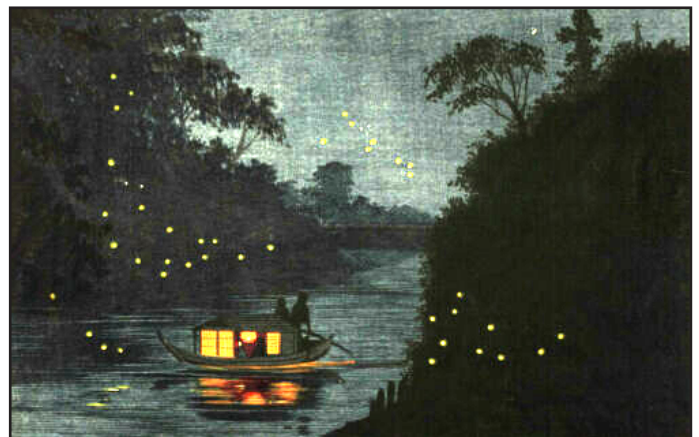
Kiyochika Kobayashi "Fireflies at Ochanomizu" (1880)

I loved the adventure of living in California's Lettuce Bowl, and now here I am in Sacramento, California's Farm to Fork Capital. That's what's painted on the big water tower I run past near my condo.