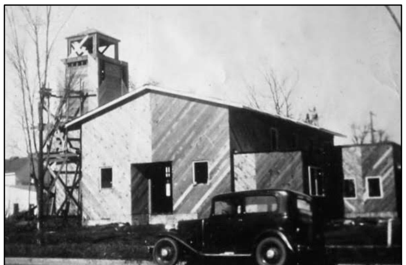
Parkview under construction ca. 1941