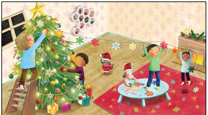
Original Christmas Card by Sachiko Yoshikawa See page 3 for purchase information