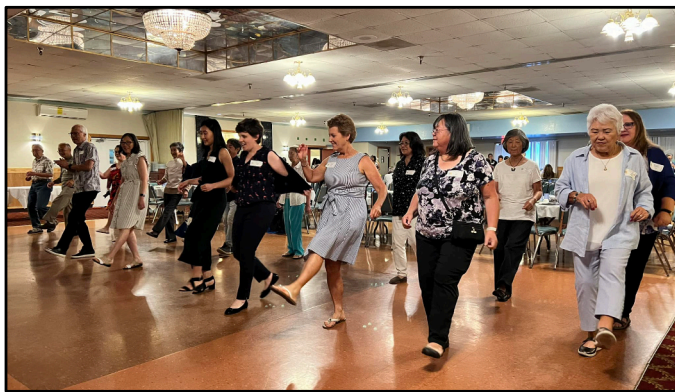
Line Dancing at Summerfest 2023

Final numbers are not yet in, but initial reports indicate we raised $14,000!! Wow! That's so exciting!