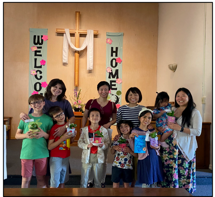
Mother's Day Joy